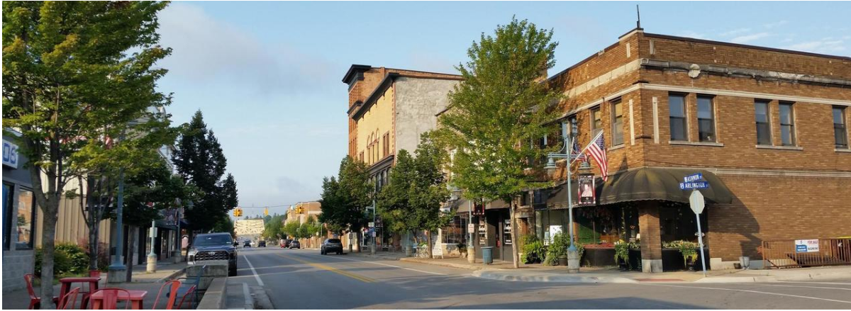
Morning in Downtown Sault Ste. Marie