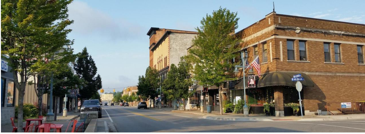
Morning in Downtown Sault Ste. Marie

Conference theme: “Bringing Stories to Light”